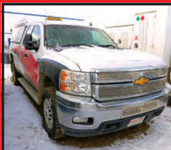
2012 CHEV 1500 EXCB