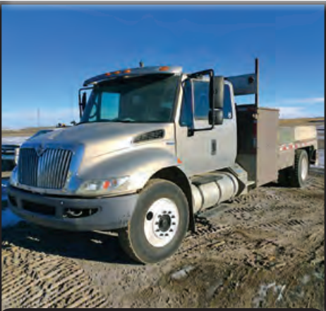
2009 INTERNATIONAL 4300

REGISTER ONLINE FOR LIVE INTERNET BIDDING ON OUR UNRESERVED INDUSTRIAL AUCTION