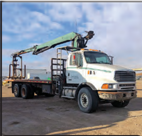
2004 STERLING LT9513 CRANE TRUCK