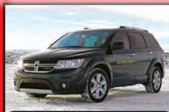
2012 DODGE JOURNEY AWD