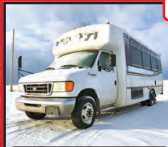
2003 FORD F450 CUTAWAY PASSENGER BUS

LARGE SELECTION OF FLEET UNITS • PARTIAL LISTING