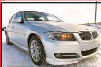
2011 BMW 323i