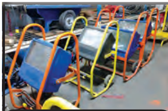
NUMEROUS ROLE AROUND SPOT LIGHTS