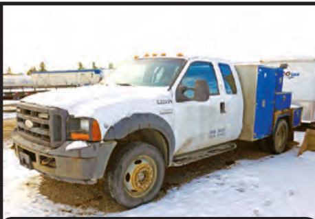
2005 FORD F550 DRW SERVICE BODY