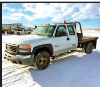
2007 GMC 3500 DRW FLAT DECK