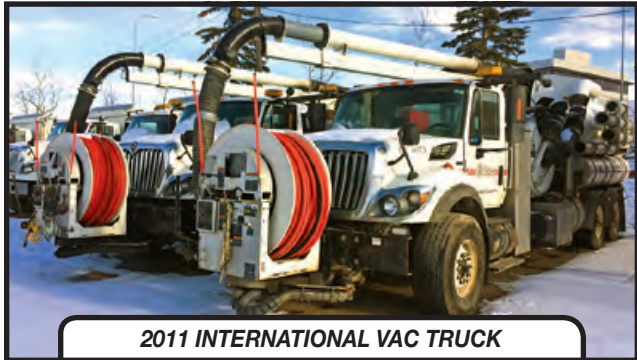
2011 INTERNATIONAL VAC TRUCK