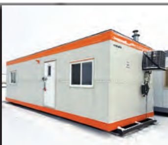
32FT X 122IN SKIDDED OFFICE