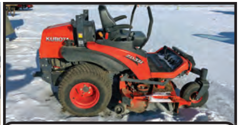
KUBOTA ZD31 ZERO TURN MOWER