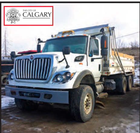
1 OF 3 2014 INTERNATIONAL 7500