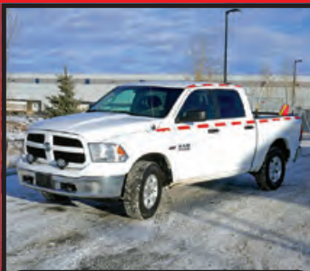
2015 RAM 1500 QDCB 4X4