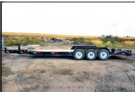
2005 TRAILTECK TRI AXLE