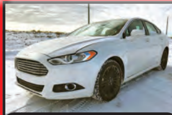
2014 FORD FUSION