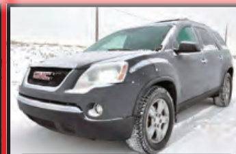
2012 GMC ACADIA AWD