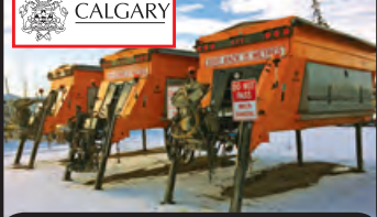
3 EPOKE 9M3 SANDER BOXES