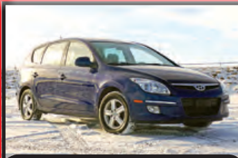
2011 HYUNDAI ELANTRA WAGON