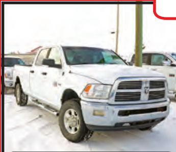
2012 RAM 2500 CRCB 4X4

APPROXIMATELY 100 FLEET • PARTIAL LISTING