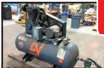
DV SYSTEMS 5HP HEAVY DUTY COMPRESSOR