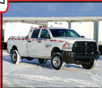
2017 RAM 2500 QDCB 4X4