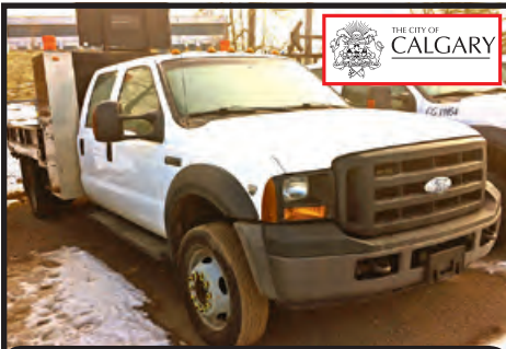
2010 FORD F550