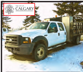
2005 FORD F550 W/LANDSCAPE BODY