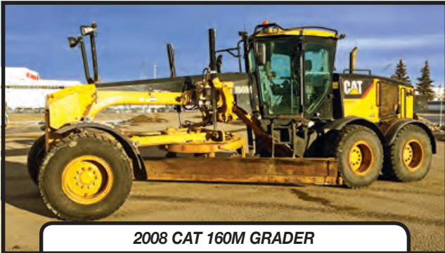
2008 CAT 160M GRADER

THU & FRI CALGARY, ALBERTA, CANADA FEBRUARY 14 TH & 15 TH , 2019 @ 9:00 AM