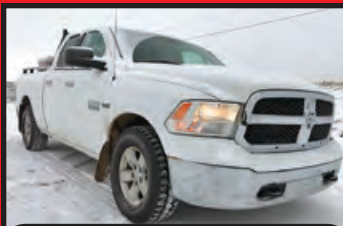
2014 RAM 1500 QDCB SLT 4X4

OVER 200 TRUCKS & SUV'S • PARTIAL LISTING