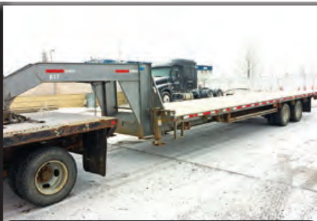
2014 ABU 30FT GOOSENECK