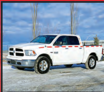
2013 RAM 1500 QDCB 4X4