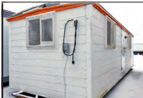
28FT. X 10FT SKIDDED OFFICET