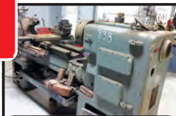
URSUS 250 PRECISION LATHE