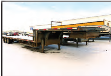
2015 OASIS 53FT STEP DECK