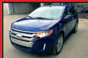
2013 FORD EDGE LTD