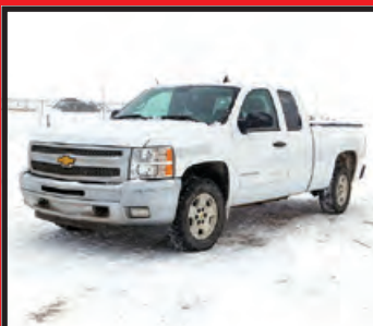
2012 CHEV 1500 EXCB 4X4