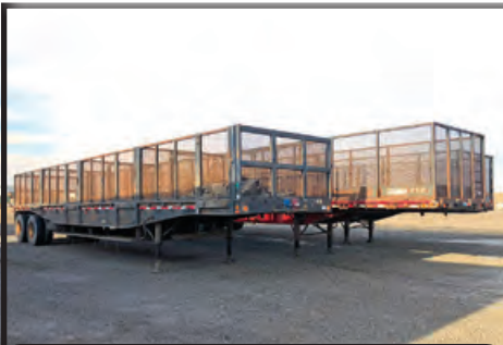
2 OF 4 TA HIGHBOYS TRAILERS