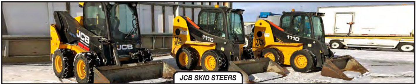
JCB SKID STEERS