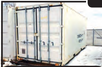
1 OF 6 SKIDDED 20FT SEACANS