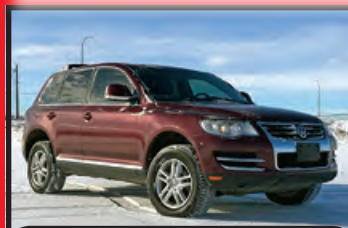
2008 VOLKSWAGEN TOUAREG