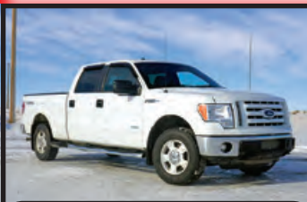
2013 FORD F150 CRCB 4X4