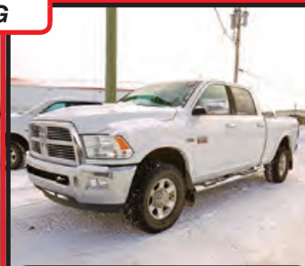
2012 RAM 2500 QDCB 4X4