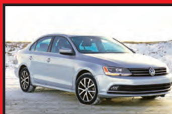
2015 VOLKSWAGEN JETTA SE