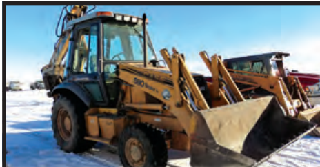
CASE 580 SUPER L