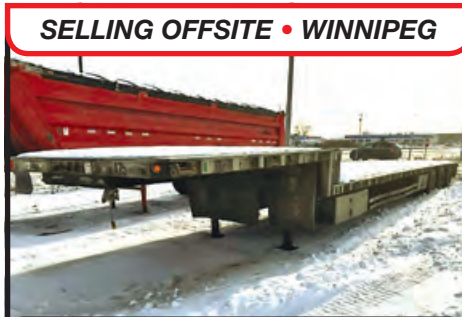
2003 WILSON TRI AXLE STEP DECK