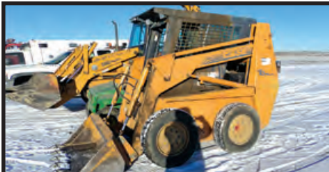
CASE SKIDSTEER 1845C