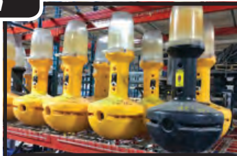
NUMEROUS WOBBLE LIGHTS