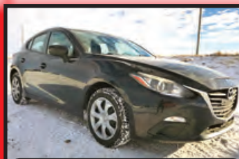
2014 MAZDA 3 SPORT