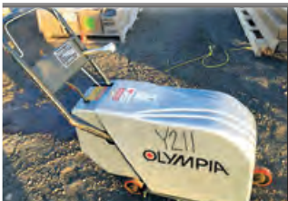
OLYMPIA BATTERY POWERED ICE EDGER