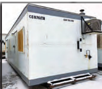
40FT. X 12FT SKIDDED OFFICE