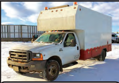
(1 OF 2) 2000 FORD F550 DRW SERVICE TRUCK