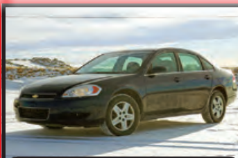
2010 CHEVROLET IMPALA