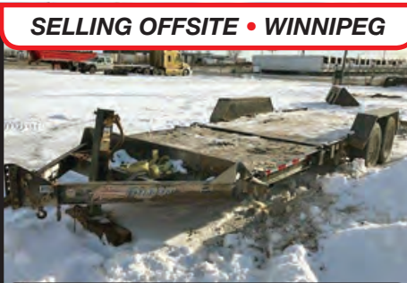
2013 TRITON PATRIOT TA FLAT DECK