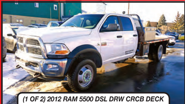
(1 OF 2) 2012 RAM 5500 DSL DRW CRCB DECK