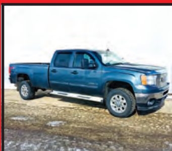
2011 GMC 2500 CRCB 4X4