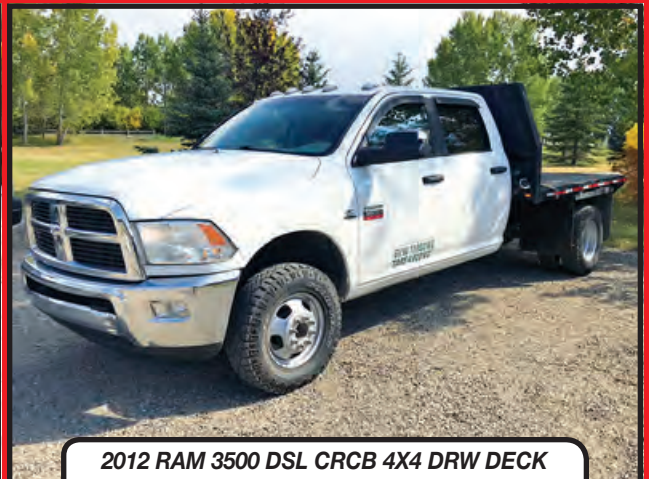
2012 RAM 3500 DSL CRCB 4X4 DRW DECK

CALGARY: 13090 BARLOW TRAIL NE TOLL FREE 1-877-811-8855 • FAX (403) 226-0707 www.maauctions.com