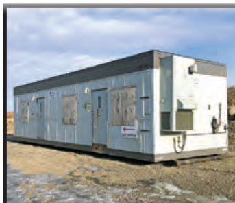
12 X 40FT SITE OFFICE