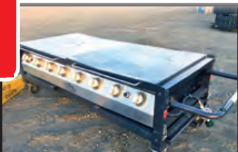
GRILL CHEF 8 BURNER FOLD DOWN BARBEQUE