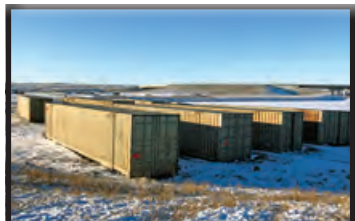
15 - 53 FT SEA CANS

TO SELL YOUR TRUCKS OR EQUIPMENT IN THIS AUCTION CALL: 1-877-811-8855 • (403) 226-0405