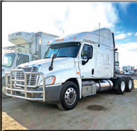
2011 FREIGHTLINER CASCADIA TA