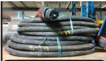
PALLETS OF ELECTRICAL CABLE