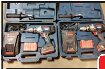
NUMEROUS HAMMER DRILLS