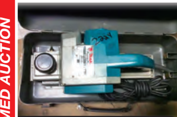
NUMEROUS POWER PLANERS