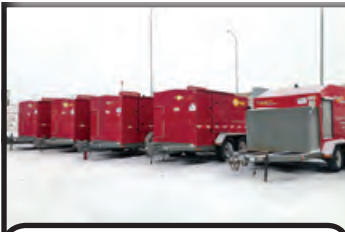
5 PUREHEAT HYDRONIC AIR HEATERS