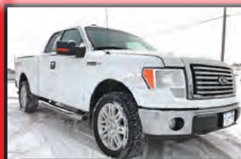
2010 FORD F150 SCB 4X4