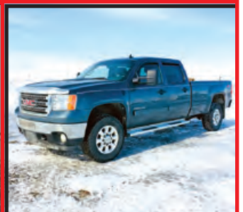
2012 GMC 2500 CRCB 4X4