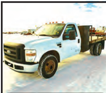
2008 FORD F350 FLAT DECK