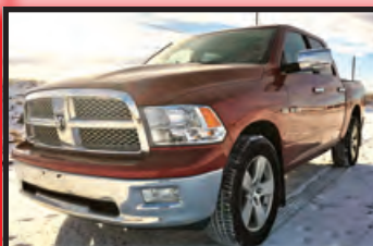
2009 RAM 1500 CRCB 4X4