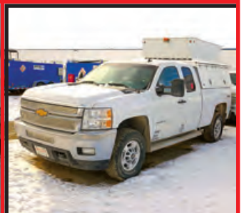
2011 CHEV 2500 EXCB 4X4