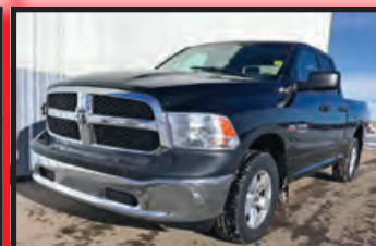
2014 RAM 1500 QDCB 4X4