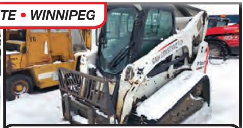
2012 BOBCAT T770 SKIDSTEER W/FORKS