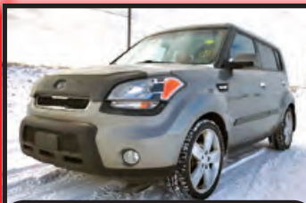
2010 KIA SOUL