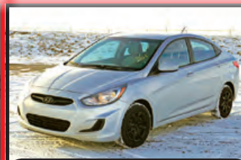
2013 HYUNDAI ACCENT