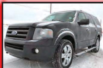
2010 FORD EXPEDITION 4X4 LTD