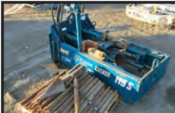
CULVER DIRECTIONAL POWER PUSH 115 & STEM