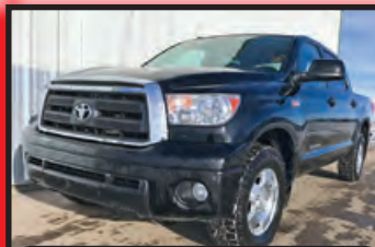
2013 TOYOTA TUNDRA CRCB 4X4