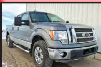
2011 FORD F150 XLT CRCB 4X4