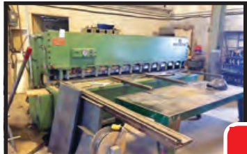
ELGA 1QUARTER X 10 PRESS & SHEAR HYDRASHEAR