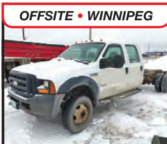
2006 FORD F450 2WD CAB & CHASSIS