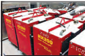
QUANTITY OF GROUND HEATERS HX200