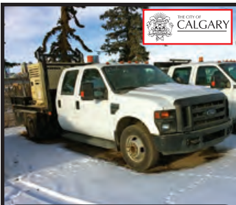
2009 FORD F350 W/COMPRESSOR