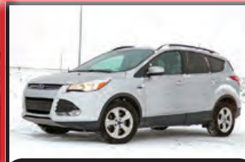
2016 FORD ESCAPE AWD

VIEWING: THURSDAY, FEBRUARY 14 TH & FRIDAY, FEBRUARY 15 TH , 2019 FROM 8:00 AM UNTIL DUSK