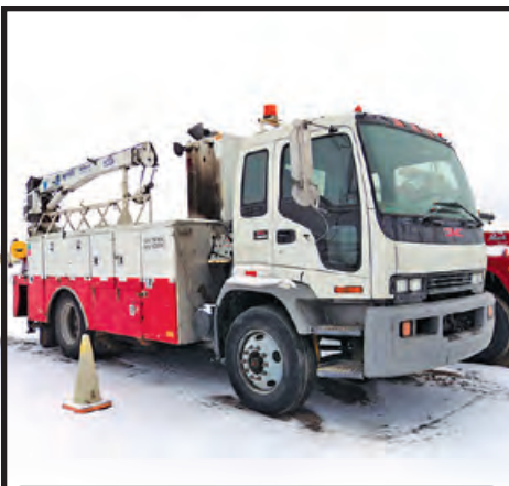
2015 GMC 8500 BUCKET

UNRESERVED • EVERYTHING SELLS TO THE HIGHEST BIDDER