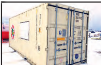
1 OF 6 20 FT SINGLE USE SEACANS