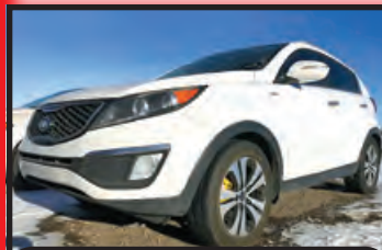
2012 KIA SPORTAGE AWD