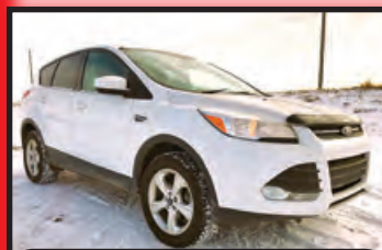
2013 FORD ESCAPE