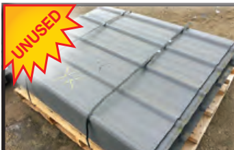
41IN X 45IN METAL SIDING