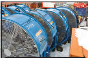
QUANTITY OF SURE FLAME FANS