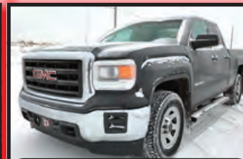
2014 GMC 1500 DCB 4X4