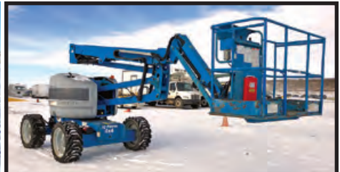
GENIE Z45 MANLIFT