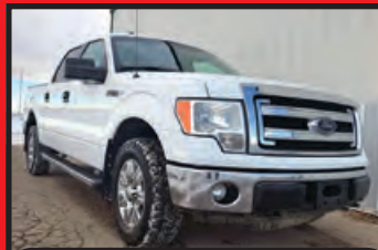
2014 FORD F150 CRCB 4X4