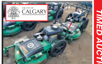
NUMEROUS BILLY GOAT LAWN MOWERS