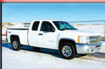
2012 CHEV 1500 EXCB 4X4