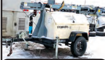
1 OF 2 TEREX LIGHT PLANTS