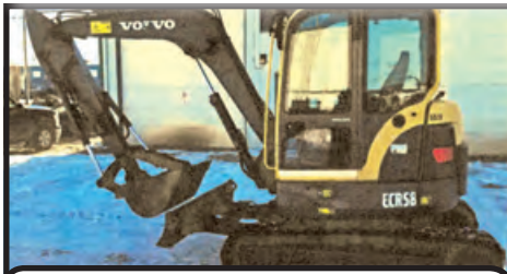
2012 VOLVO ECR 58 EXCAVATOR