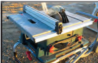
BOSCH TS3000 FOLD DOWN TABLE SAW