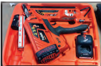
NUMEROUS FRAMING NAILERS