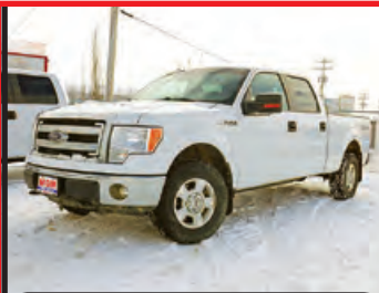
2013 FORD F150 CRCB 4X4