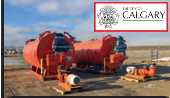
2 1993 VOLCANO 10, MILLION BTU NAT GAS BOILER