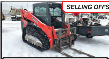
2016 KUBOTA SVL 95-2S SKIDSTEER