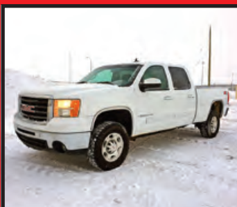
2008 GMC 2500 CRCB 4X4