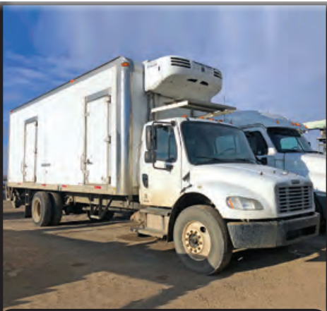
2007 FREIGHTLINER M2 W/REEFER