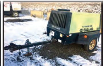
SULLAIR 185JD COMPRESSOR

VIEWING: TUESDAY, FEBRUARY 12 TH & WEDNESDAY, FEBRUARY 13 TH , 2019 FROM 8:00 AM UNTIL DUSK www.maauctions.com