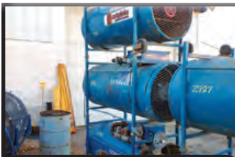
QUANTITY OF SURE FLAME HEATERS