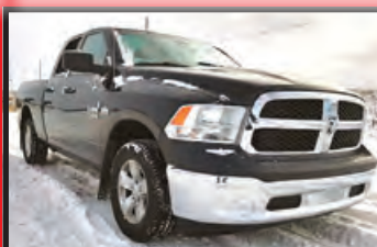
2014 RAM 1500 EXPRESS QDCB 4X4