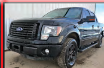
2011 FORD F150 CRCB 4X4