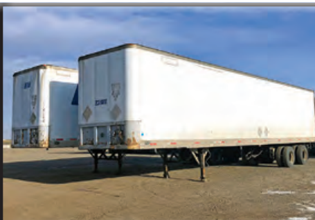
2 OF 5 53FT TA VAN BODIES