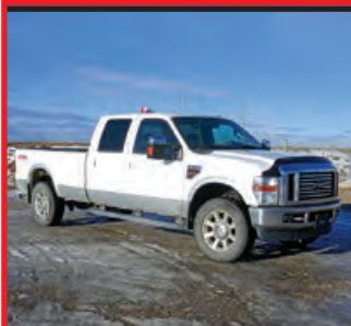
2010 FORD F250 DSL CRCB 4X4