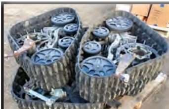
LG QUANTITY OF MATTRACKS XT UR UTV TRACKS