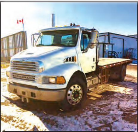
2006 STERLING ACTERRA DECK