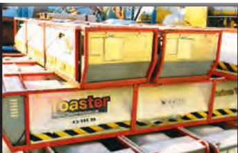
10 TOASTER GROUND THAW UNITS