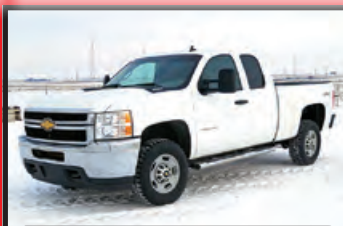
2011 CHEV 2500 EXCB 4X4