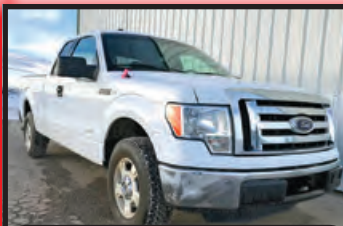
2011 FORD F150 SCB 4X4