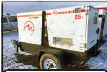
MAGNUM MMG55FH GENERATOR