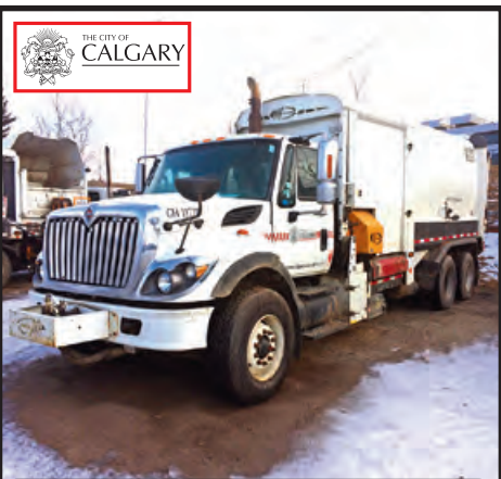
1 OF 2 2009 INTERNATIONAL WORKSTAR REFUSE