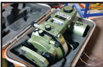
NUMEROUS PIECES OF ENGINEERS SURVEY EQUIPMENT