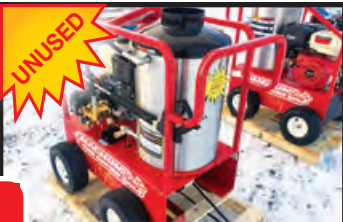
1 OF 3 MAGNUM 4000 PRESSURE WASHERS