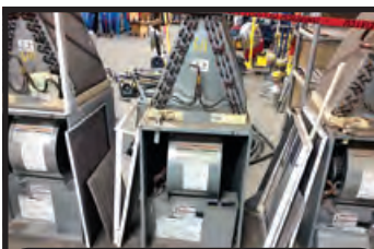
1 OF 3 INTERTHERM ELECTRIC FURNACES