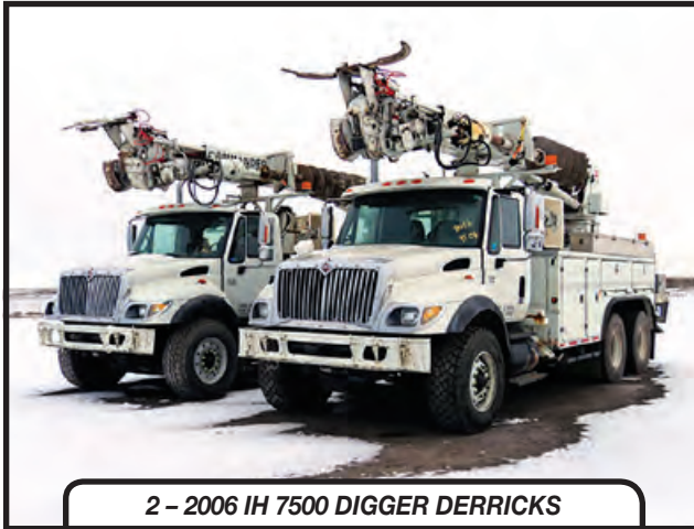
2 - 2006 IH 7500 DIGGER DERRICKS