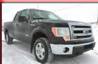
2014 FORD F150 SCB 4X4