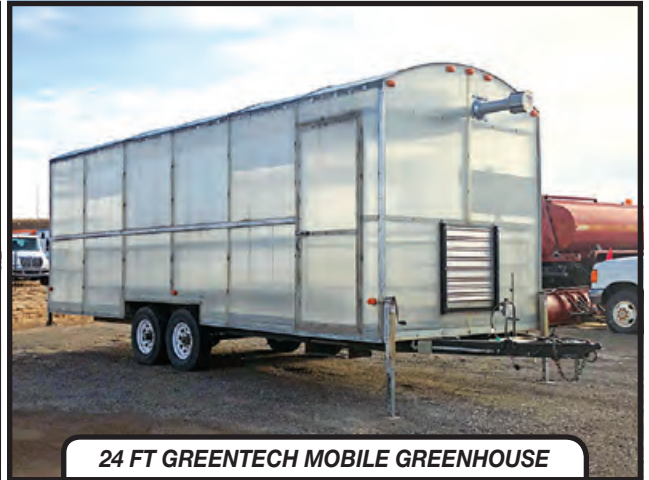
24 FT GREENTECH MOBILE GREENHOUSE