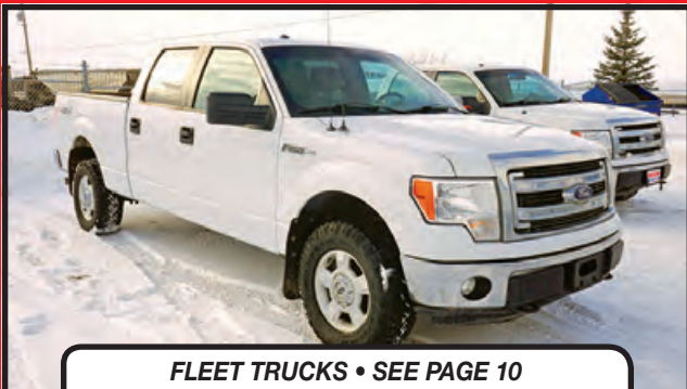
FLEET TRUCKS • SEE PAGE 10