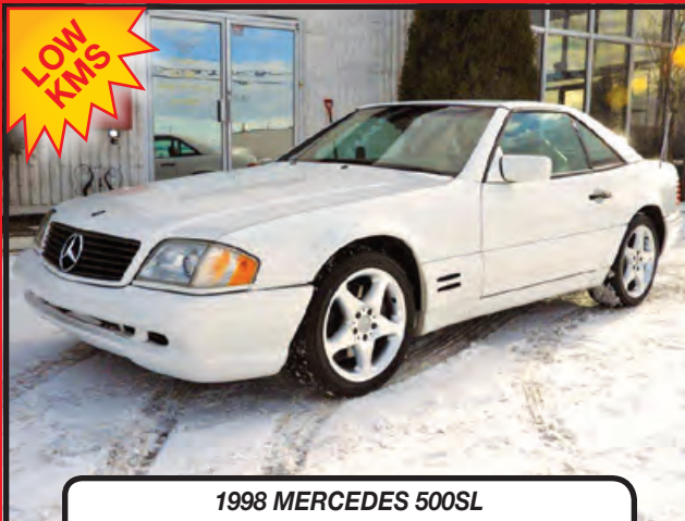
1998 MERCEDES 500SL