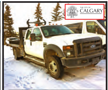
2008 FORD F550 SIGN DECK