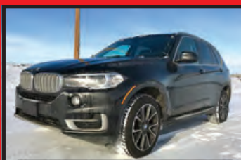
2015 BMW X5 AWD