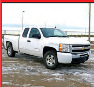
2010 CHEV 1500 EXCB 4X4