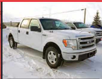
2014 FORD F150 CRCB 4X4