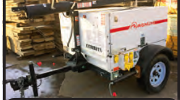
MAGNUM LIGHT PLANTS