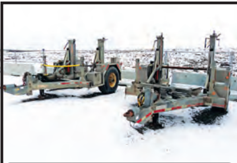
2 REEL TRAILERS

UNRESERVED • EVERYTHING SELLS TO THE HIGHEST BIDDER