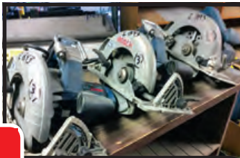
NUMEROUS SKILL SAWS