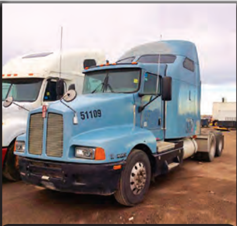
2007 KENWORTH T600 TA