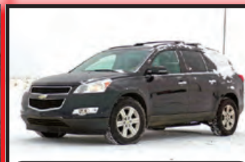
2012 CHEVROLET TRAVERSE AWD