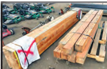
LOT OF LAMINATED TRUSSES