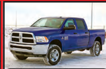
2015 RAM 3500 CRCB 4X4