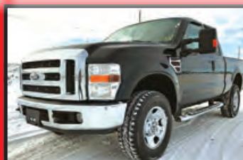
2008 FORD F350 SCB 4X4