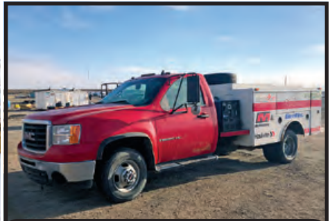
2007 GMC 3500 SERVICE