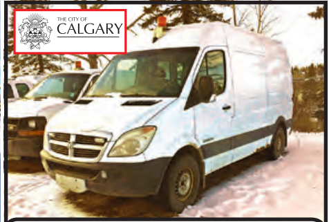
(1 OF 2) 2007 DODGE SPRINTERS