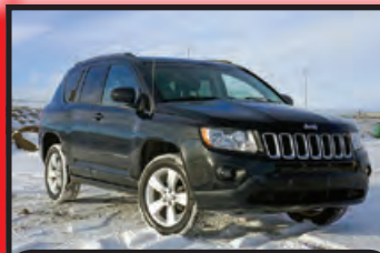
2011 JEEP COMPASS 4X4