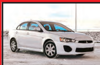
2016 MITSUBISHI LANCER

APPROX. 200 CARS & VANS • PARTIAL LISTING