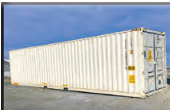
40 FT SINGLE USE SEACAN