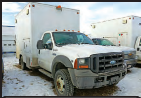
(1 OF 4) FORD F450 DRW VANBODIES

PARTIAL LISTING • NEW PRODUCT ARRIVING DAILY