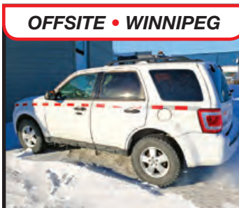
2011 FORD ESCAPE