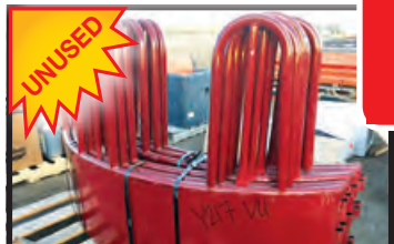
ROUND SIX PIECE BALE FEEDER