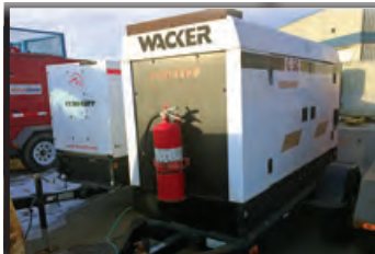
WACKER G50 GENERATOR