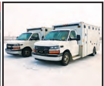
(2 OF 4) CHEV AMBULANCES

TO SELL YOUR TRUCKS OR EQUIPMENT IN THIS AUCTION CALL: 1-877-811-8855 • (403) 226-0405