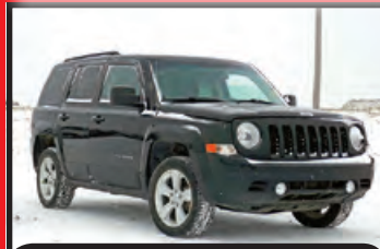
2013 JEEP PATRIOT 4X4