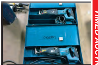
NUMEROUS RECIPROCATING SAWS