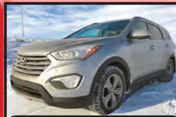
2014 HYUNDAI SANTA FE AWD