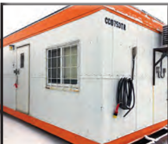
32FT X 10FT SKIDDED OFFICE