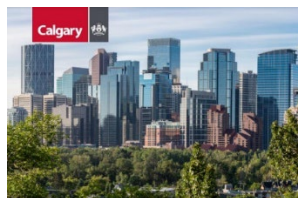
Funding climate action in the City of Calgary

Following the City Council's declaration of a Climate Emergency late in 2021, City Administration has been tasked with creating a new climate strategy. The implementation plan of the strategy is expected to be finalized and voted on in November 2022.